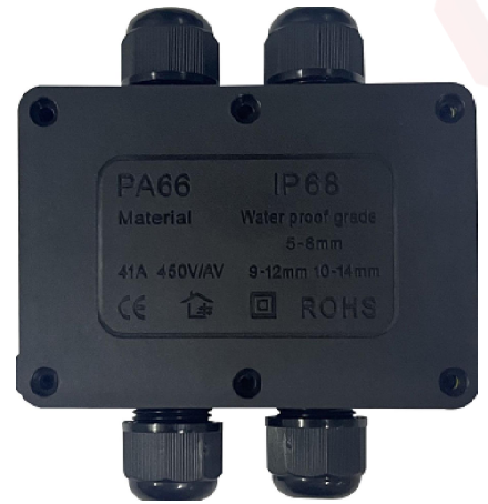
(Series Image-Reference Only)